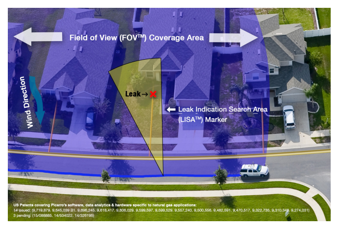
Figure 2. Picarro Advanced Leak Survey Technique

The reasons for multiple passes over multiple nights is to collect data in a variety of wind conditions (multiple wind directions) to achieve high Field of View coverage of the gas assets. Multiple passes also ensure that the leak detection rate is >95% since the single-pass detection for a given leak is generally only 25-35% and the detection probability scales as the probability of independent events, reaching >95% for leaks within the Field of View.