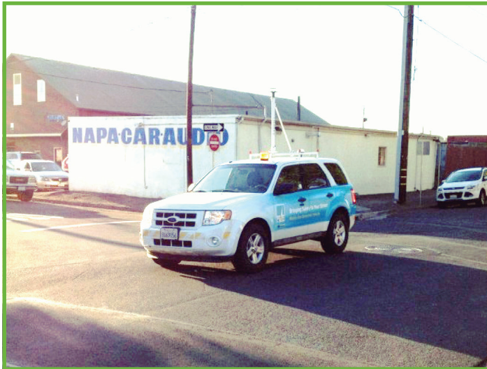
Figure 1. PG&E's fleet of Picarro Surveyor vehicles responded immediately after the August 24, 2014 Napa earthquake to do a rapid, post-disaster survey of Napa's entire gas infrastructure.

The system is ideally suited for targeted, rapid surveys before high-profile public gatherings including parades, official visits, concerts and sporting events. Picarro was used to quickly perform a special leak survey in Santa Clara, CA in the days leading up to Super Bowl 50 and has been used for special leak surveys before other Super Bowls, parades and similar large events.